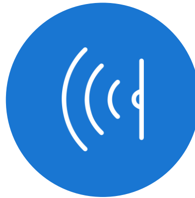
Motion-sensor toilets, faucets, soap and paper towel dispensers