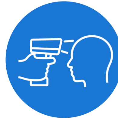
Body temperature scanning devices