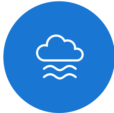
Air cleaners and HVAC filters to reduce airborne contaminants