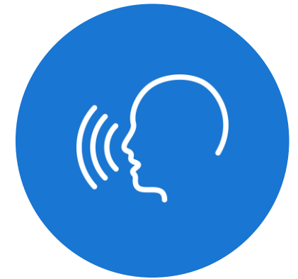
Virtual Help Desk Kiosks